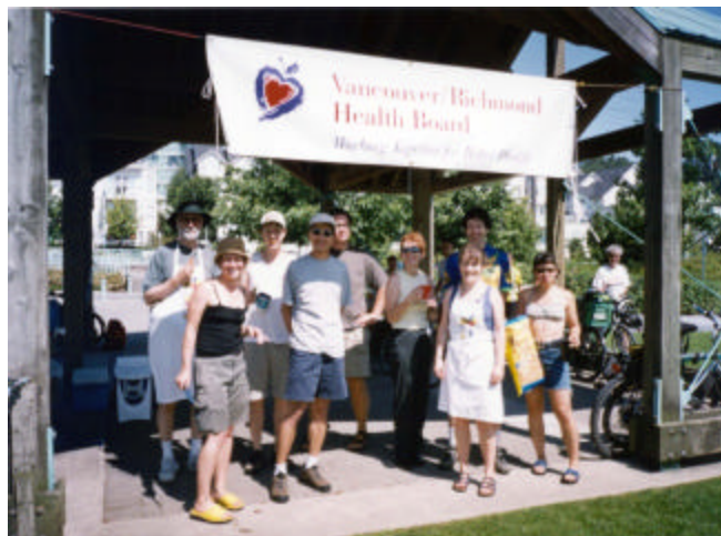
It was a fabulous day for a picnic in August (see page 3).

In the early 1990's, the province developed the Interim Cycling Policy. Although the interim policy was technically in effect, it basically sat dormant and was not properly applied. In fact, it was often used as an excuse for not doing things. In 1999, the BCCC requested a workshop with Transportation and Highways staff to work towards an improved final policy. Members of the BCCC, the VACC and other cycling organizations were able to agree to changes to the policy. Amongst the changes were the additions of a provincial cycling coordinator, a provincial Bicycle