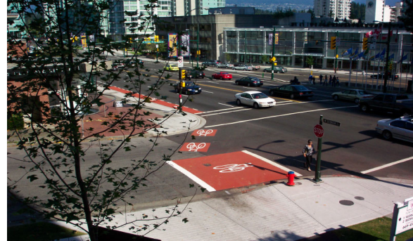
Nicola and Georgia St. Bike Box Bonnie Fenton

thrilled to have half the traffic going by: half the noise; half the air pollution; half the number of cars endangering exits from driveways. Westbound traffic could still flow smoothly off the Burrard Bridge and avoid causing congestion on Cornwall by continuing to flow straight past MacDonald. The only inconvenience to drivers would be losing the opportunity to speed eastbound on the "30 km/hr." Point Grey Road.