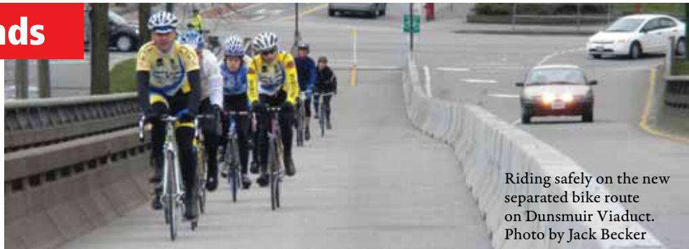
Riding safely on the new separated bike route on Dunsmuir Viaduct.

Katimavik is a federal youth work program (which I had thought ended long ago – but no !). The coordinator of one project thought that it would